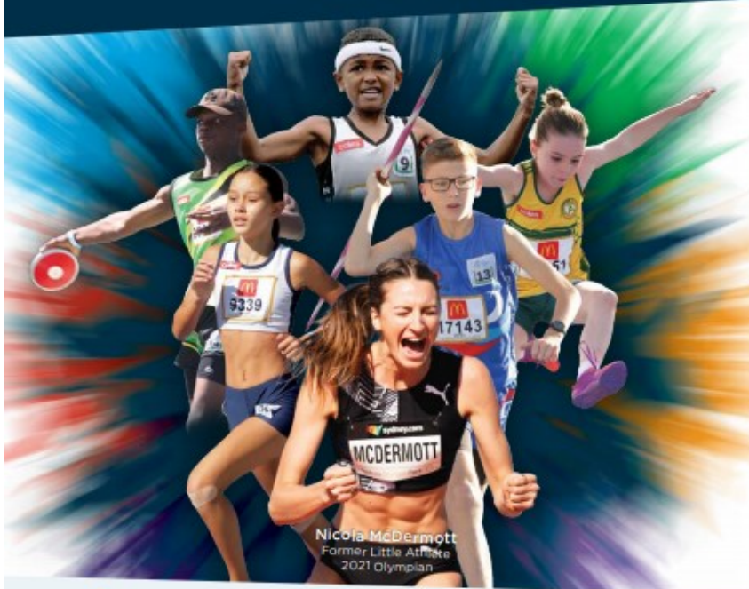
Nicola McDermott Former Little Athlete 2021 Olympian

Sign up for your local Little Athletics Centre this Summer